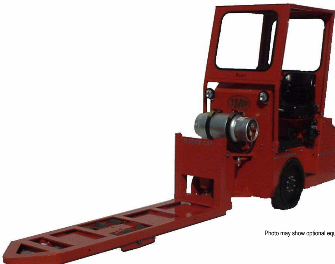
Photo may show optional equipment