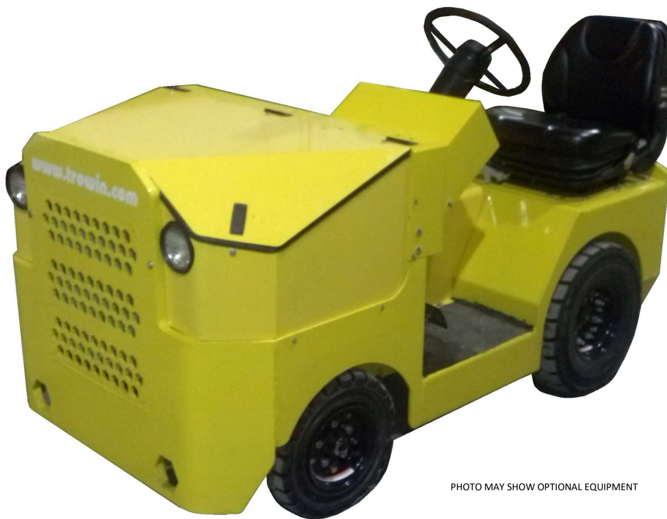
PHOTO MAY SHOW OPTIONAL EQUIPMENT

2,000 to 4,000 lbs DBP Narrow Aisle Tow Tractor