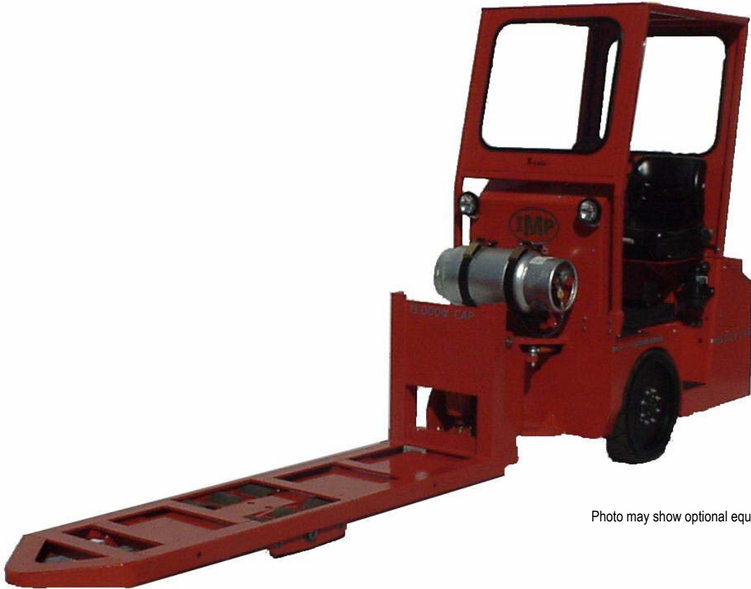
Photo may show optional equipment