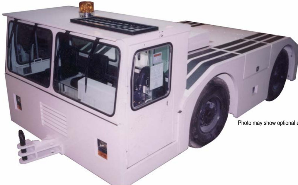
Photo may show optional equipment