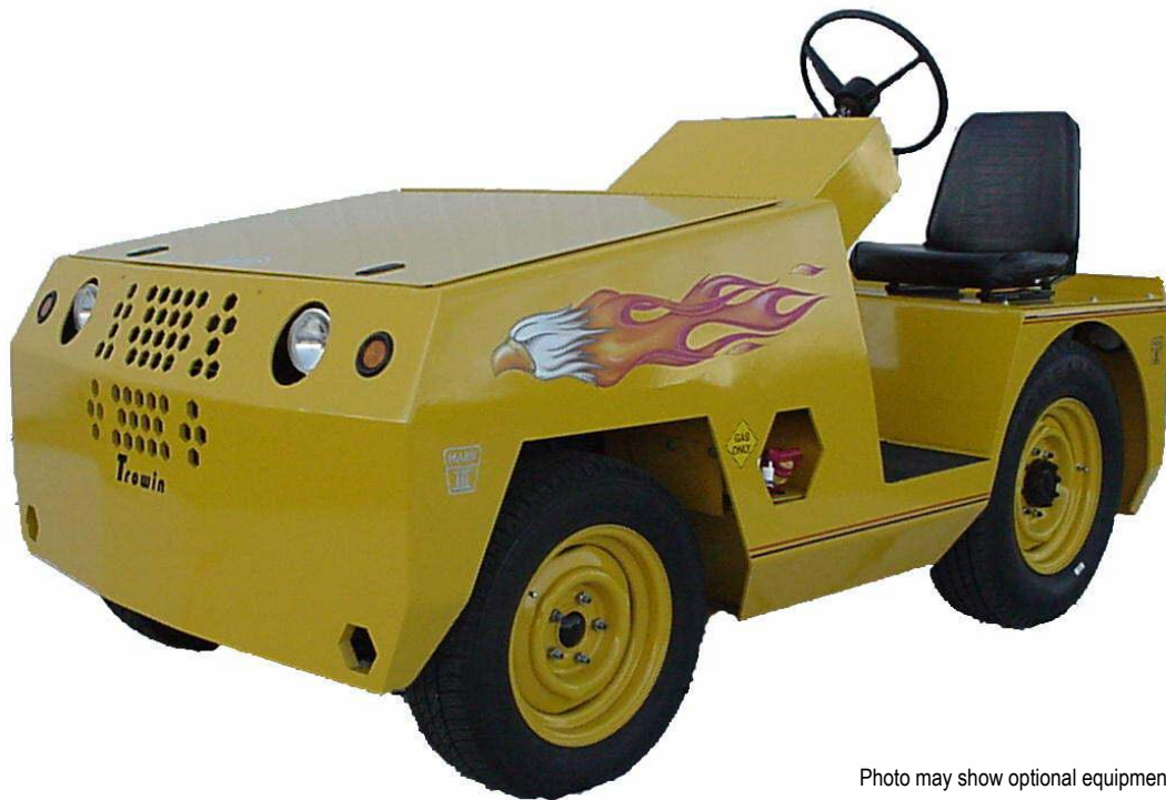
Photo may show optional equipment